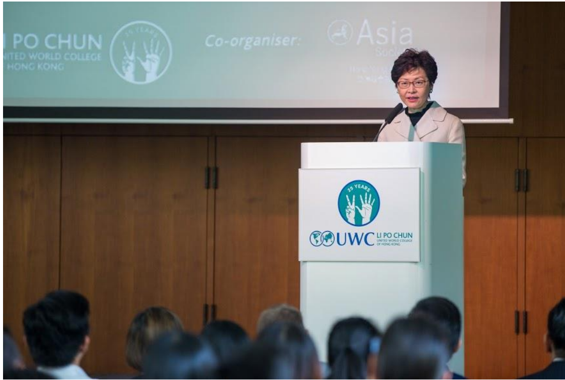
The Honourable Mrs Carrie Lam Cheng Yuet-ngor, The Chief Executive of the Hong Kong Special Administrative Region, delivering her opening speech at the Symposium PHOTO 3: