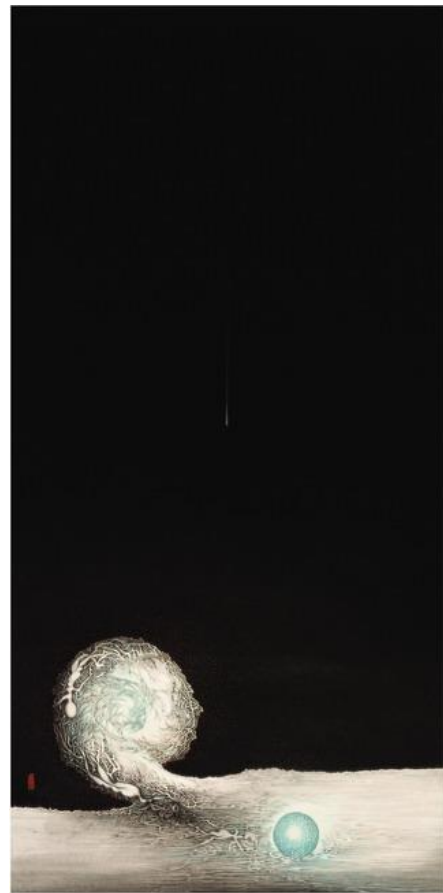
My Inner World 1976 Ink and color on xuan paper 169.7 x 77.5 cm Collection of Hong Kong Museum of Art