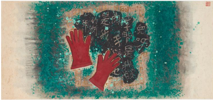
The Hand 1950s Mixed media on xuan paper 57 x 119 cm Private collection