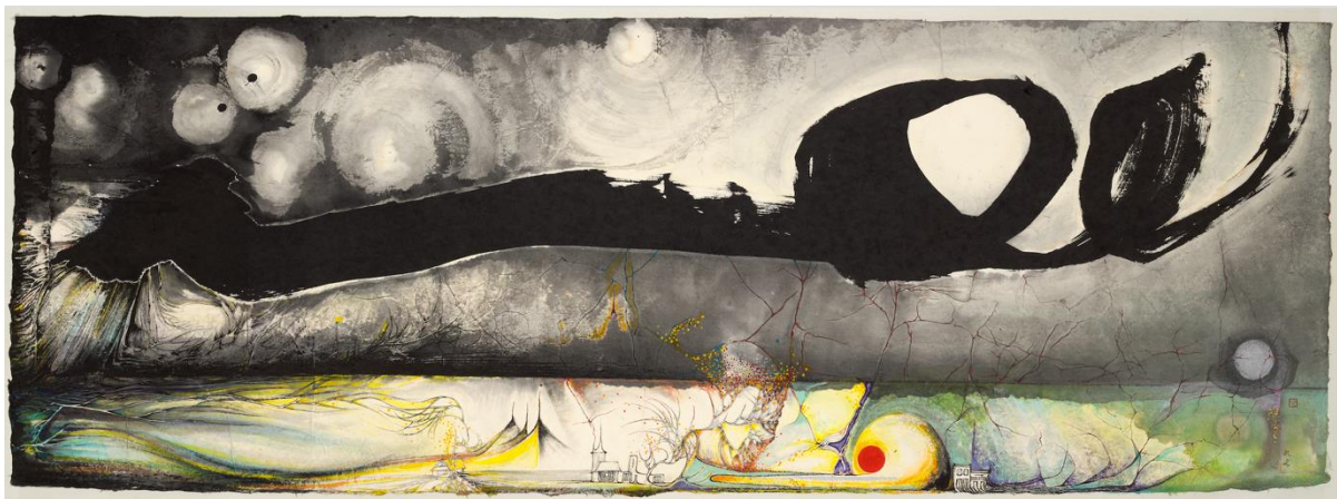
The Universe VI c.1998 Ink and mixed media on hemp paper 76 x 213 cm Private collection