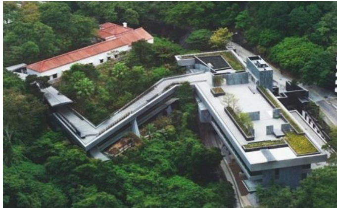
Top view of Asia Society Hong Kong Center

Let's follow the template and steps to build the model of Asia Society Hong Kong Center.