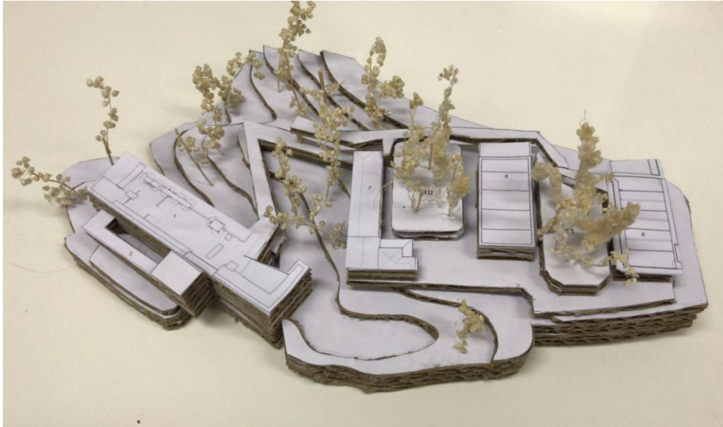
Model courtesy of Vicky Chan, AIA