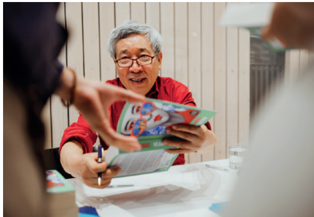
1 Yan Lianke, Zurich, Jul 2023