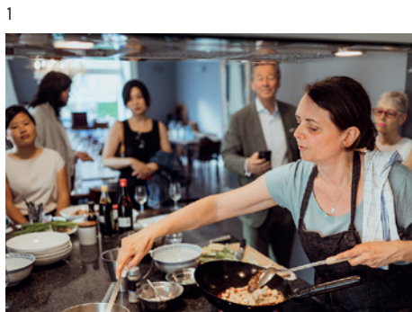
1 / 2 Cooking demonstration with Fuchsia Dunlop, Zurich, Jul 2022

Our cosmopolitan Passport Community is made up of over 30 Asia-connected individuals who are passionate about Asia and recognize the need for enhanced Asia Competence in Switzerland. Our Passport Members receive regular invitations to exclusive gatherings, such as our Executive Roundtable series, unique Art Tours, as well as special events; like the cooking demo with British star chef Fuchsia Dunlop, who specializes in Sichuanese cuisine and took us (and our tastebuds) on a culinary trip to the southwest of China.