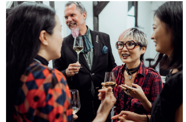
2 ... and many people from the Japanese diaspora in the audience, Zurich, Oct 2023