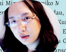
AUDREY TANG Digital Minister of Taiwan