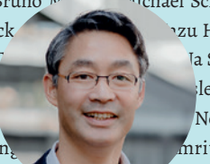
PHILIPP RÖSLER Former Vice-Chancellor of Germany, Honorary Consul of Vietnam, Consultant