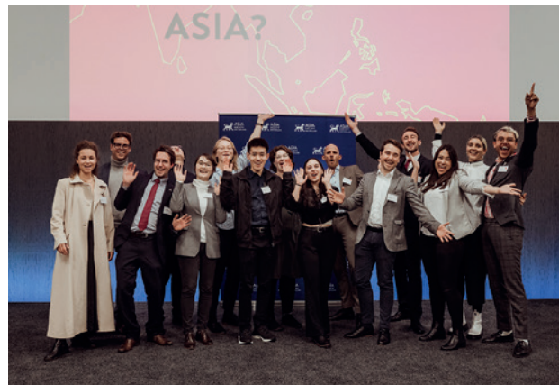
1 Group Shot: The 2022 Gen A Fellows at STATE OF ASIA, Zurich, Nov 2022

Asia Society Switzerland is committed to empowering young voices in the dialogue with Asia , recognizing youth as a key driver of Switzerland's future success in the region. Since 2020, 25 students and young professionals are selected each year to become Fellows of the Gen A – Young Leadership Program . We host a series of expert roundtables and workshops for the Fellows exclusively, expose them to regions and topics outside their daily routine, and support their work on an individual project, featured at our STATE OF ASIA conference. Gen A is a multi-disciplinary community of young Asia-curious individuals from all of Switzerland. Since 2024, the program is generously supported by the Ernst Göhner Stiftung and the Hirschmann Stiftung.