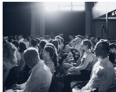
3 Audience at the Oxford Debate LIVE, Zurich, Jun 2023

A key pillar of our work are arts and culture . Through the Big Picture event series, we celebrate art in all its forms and shapes: Be it food, movies, museums or literature. We invite artists, curators, and experts to talk about their practices and share their work for our audiences to experience it first-hand. The public event series allows for meaningful conversations and encounters, both off and on stage, as seen here in pictures from the event 'Big Picture: Kimono – Unwrapping A Living Thing'.