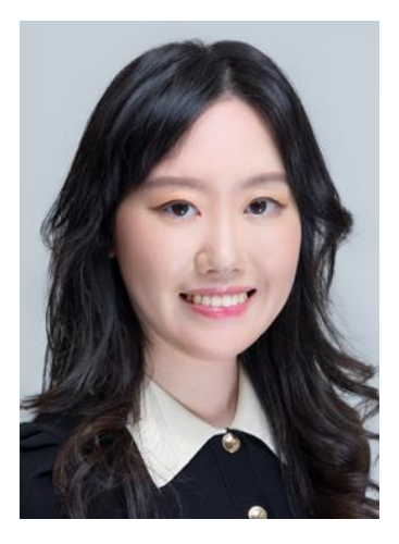
HONG KONG SAR, CHINA