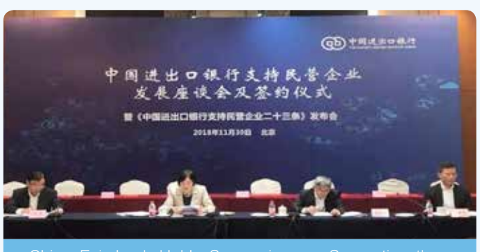
China Eximbank Holds Symposium on Supporting the Development of Private Enterprises

On 30 November 2018, China Eximbank held the symposium on supporting the development of private enterprises and signing ceremony and the launch of the Twenty-three Measures of China Eximbank in Support of Private Enterprises, with the aim of facilitating the development of private enterprises in both international and domestic markets.