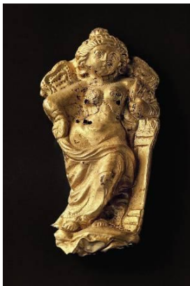
So-called winged Aphrodite leaning against a pillar. Pakistan. 1st century CE. Gold. H. 2 1/2 in. (6.3 cm). National Museum of Pakistan, Karachi.

The exhibition is organized into three thematic sections. "Classical Connections" examines early connections with the classical world and associated imagery, in contrast to that of Indian Buddhist art. The influence of Greco-Roman culture in the region began with its conquest by Alexander the Great, although the Indo-Greeks who occupied Gandhara around 180 B.C.E. were responsible for the western, Hellenistic influence evident in early Gandharan works. Motifs from Greek mythology and western architectural elements such as Corinthian capitals can be identified in the works on view.