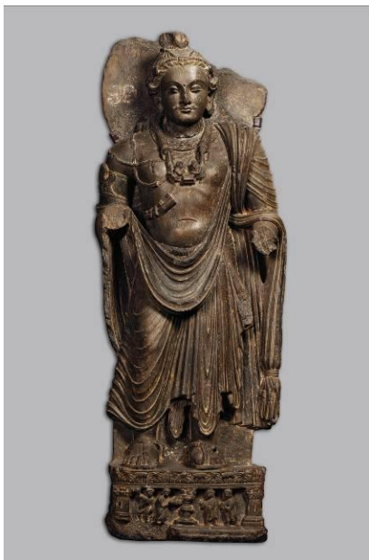
Standing Bodhisattva Maitreya. Pakistan. 3rd–4th century CE. Gray schist. H. 39 3/8 x W. 15 3/16 x D. 5 1/2 in. (100 x 38.5 x 14 cm). Central Museum, Lahore.

Asia Society Museum presents an exhibition of spectacular Buddhist sculptures, architectural reliefs and works of gold and bronze from the Gandhara region of Pakistan, most never exhibited before in the United States. These artworks show the rich artistic heritage of Gandhara as a geographical and historic region and as a particular style of art. The Buddhist Heritage of Pakistan: Art of Gandhara reveals the complex cultural influences—from Scytho-Parthian to Greco-Roman traditions—that fed the extraordinary artistic production of this region from the first century B.C.E. through the fifth century C.E.