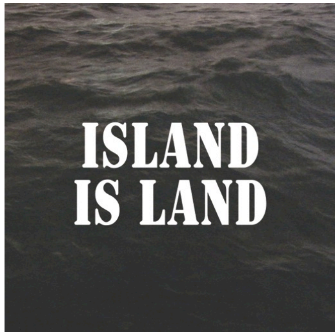
Map Office, Island is Land , 2014, print with styrofoam letters. Courtesy of the artists.