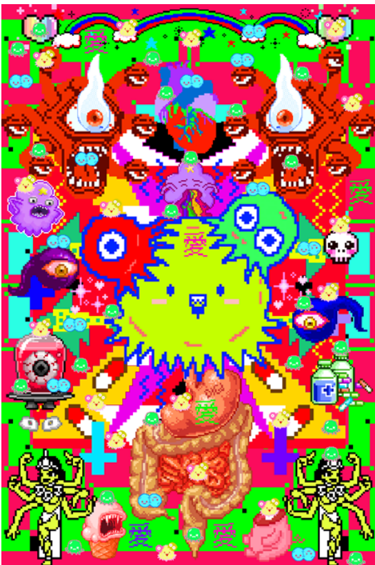
Lu Yang, Cancer Baby (still), 2014, video with sound.

On Monday, October 27th , Asian Contemporary Art Week is pleased to highlight The Armory Show's 2015 Focus Announcement reception, an invitation-only annual celebration that officially presents the fair's much anticipated Focus session and curator to VIP collectors, museum professionals, and press.