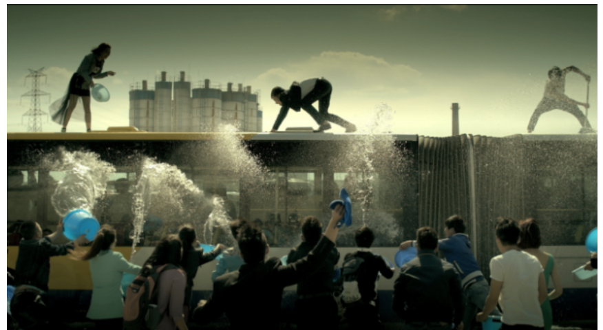
Polit-Sheer-Form Office, Do the Same Good Deed, 2014, performance still.