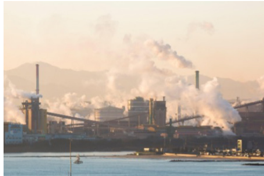
Integrated steelworks in Korea - the steel sector is Korea's largest industrial GHG-emitting sector

progressing through the EU policymaking system. Furthermore, the current proposal defines a framework for the CBAM's functionality, but many technical details will be developed at a later stage as "implementing acts," as listed in Annex II. This paper tries to avoid speculation about these technical