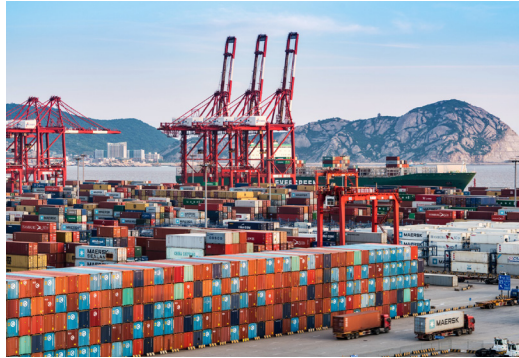
Aerial view of Shanghai Yangshan deepwater port

ETS is fully linked to the EU ETS. Producers in these countries, therefore, face the same carbon price as that in the EU.