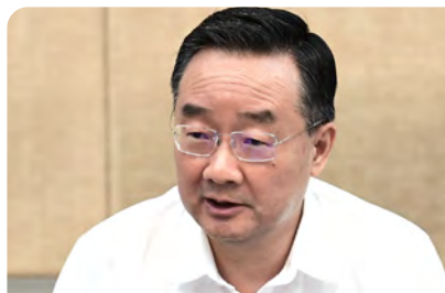
Tang Renjian 唐仁健 Minister of Ag and Rural Affairs

A volume cap on coal consumption would have more effect. The massive fossil fuel SOEs will most likely be able to stave this off, despite the imperative to peak emissions. That said, the 5-year plan will set ambitions in power generation, grid upgrades, power pricing and emissions reduction. These will become hard targets in subsequent