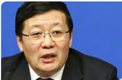
Lou Jiwei 楼继伟 former finance minister

Take retirement ages. Plans for gradually raising them will finally emerge in the coming five years. Current age limits (between 50 and 60 depending on gender and occupation) were set in 1978. With birth rates falling to a critical level in 2019, if nothing is done, retirees will equal the workforce in number by 2050. Already under severe pressure, pension funds have run into the red by over C¥100 bn (AU$200 million) annually since 2013. The funding gap is expected to top C¥1 tn (AU$200 bn) in the next decade. On the other hand, unemployment is a major concern, worsened by COVID-19. Infant and elderly care, typically provided by