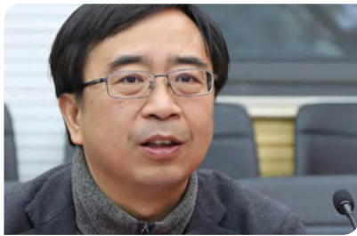
Pan Jianwei 潘建伟 University of Science and Technology of China executive vice president

Breaking foreign tech strangleholds entails working with the world, argues quantum specialist Pan. Knowledge should be made universal via a 'controlled open source' paradigm. 'Control' comes from asymmetric advantages in key links in the supply chain, preempting any potential chokepoints. 'Open source' deals on this basis will, says Pan, lead to cutting-edge breakthroughs. Requirements for investment-hungry scitech firms to make profits should be relaxed, he advises, giving capital markets more say in deciding a firm's growth potential. His firm QuantumCTek listed on the STAR market in July 2020.