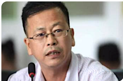
Cui Dongshu 崔东树 China Passenger Car Association secretary general

A strategy is needed to meet the C¥35/kg (AU$7/kg) target price for hydrogen fuel by 2024, warns Cui, which will be included in the hydrogen industry 5-year plan, currently in draft. Rather than propping up sales with subsidies or credits, a 21 Sep 2020 measure confirms Beijing will reward urban clusters for building hydrogen ecosystems, empowering local government rather than industry.