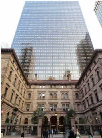
LOTTE New York Palace Hotel

At 455 Maddison Avenue sits one of New York's most iconic buildings, the LOTTE New York Palace Hotel. On September 16, 2015, Lotte officially unveiled the LOTTE New York Palace Hotel after taking over the historic New York Palace Hotel. The Lotte Group purchased the New York Palace hotel as the Group looks to expand into the overseas hotel business. The deal reflects the plans of Dong-bin Shin , chairman of both the Asia Society Korea Center and the Lotte Group, to grow the company into one of Asia's top three brands. Lotte currently operates ten hotels in Korea and five overseas, including opening and buying hotels in Russia, Vietnam, Uzbekistan and Guam. It is also in the process of building hotels in China and Myanmar and is aiming to acquire around 40 hotels worldwide by 2018, including a new boutique hotel in St. Petersburg, Russia. The Asia Society Korea Center met with Chairman Shin to talk about this historic purchase.