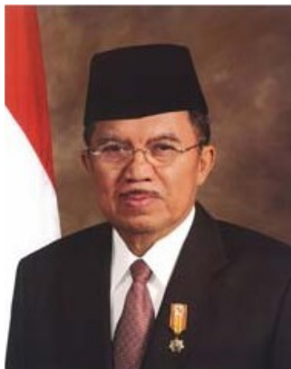
H.E. Jusuf Kalla

H.E. Jusuf Kalla became Vice President of Indonesia for the second time in October last year and since then he has been looking at strengthening the relationship between Indonesia and Korea. On a recent trip to Seoul, H.E. Kalla talked about how the two countries have similarities in having struggled for independence and then developed as nations over the last 70 years. Both countries have large numbers of overseas workers living in Indonesia and Korea and Mr. Kalla outlined his hope for furthering economic and investment action between the two. H.E. Kalla took time out of his busy schedule to speak with the Asia Society Korea Center to talk about his visit and his hopes for future Indonesia-Korea cooperation.