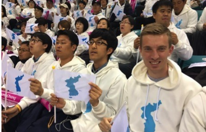
Fans were given flags and sweatshirts emblazoned with the Korean peninsula

The palpable tension of the stadium though, in an instant, was relieved and replaced with jubilation as the players high-fived. The crowd raised their unified Korean peninsula flags and continued to sing "We Are One", sensing that their encouragements was having an effect. Next, to mark the United Nation's International Day of Sport for Development and Peace, the president of the International Ice Hockey Federation took to the ice for a commemorative photo. As the players mixed and formed two rows for the picture, fans cheered wildly, with noise reaching an absolute crescendo. Listening to the fans, it was clear to me this match was not so much South Korea "versus" North Korea, but rather South Korea "with" North Korea.