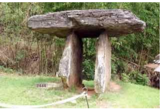
Dolmen at Gochamg

Although the largest concentration of dolmens can be found in the south-western locations of Gochang and Hwasun, a third significant range of stones is situated on the island of Ganghwa, not far from Incheon Airport. For somebody wanting to visit South Korea's dolmens, planning is important as the sites are not geographically close to each other and are not well served by public transportation. On the plus side, the dolmens are located in rural areas of the country so you are generally left alone to explore these areas of significant cultural value. The Gochang, Hwasun, and Ganghwa Dolmen may well be the least populated UNESCO sites you visit.