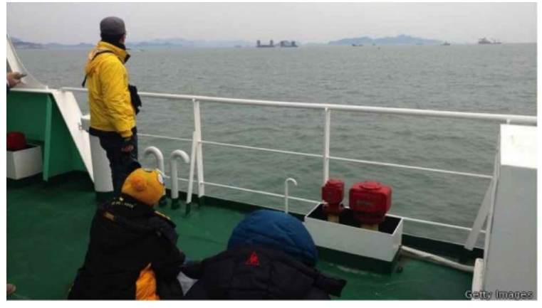
Family members looking on as the Sewol recovery process begin