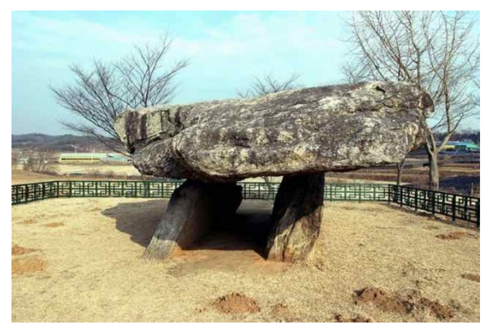
Dolmen at Ganghwa

January 2017 - For many seasoned travellers, UNESCO World Heritage Sites provide the ultimate bucket list items for experiencing the Earth's cultural and natural heritage. While it would take many years of travel to see all 1052 designated sights around the world, a short trip to Korea would enable you to tick off at least twelve. South Korea is home to eleven cultural sites and one natural site. Over the course of the next few months, Asia Society Korea will be previewing selected World Heritage Sites through a historical, cultural, and travel perspective. We kick off our program in the south-western part of the peninsula by visiting Gochang, Hwasun, and Ganghwa Dolmen Sites.