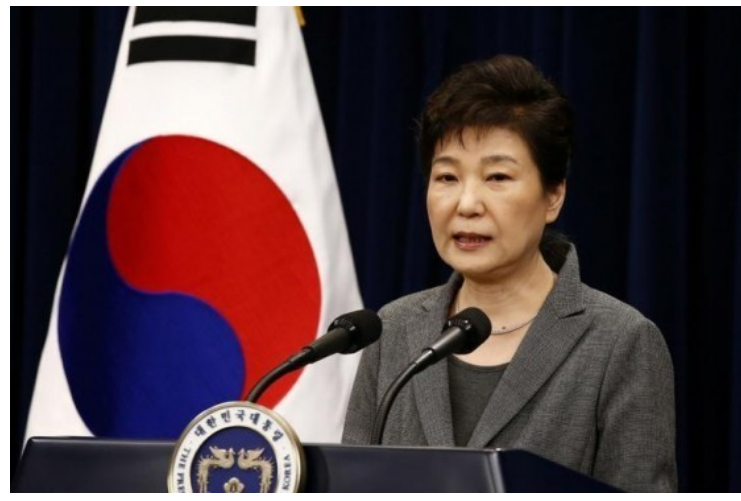
Park Geun-hye.

mous decision for impeachment from the country's top judges.