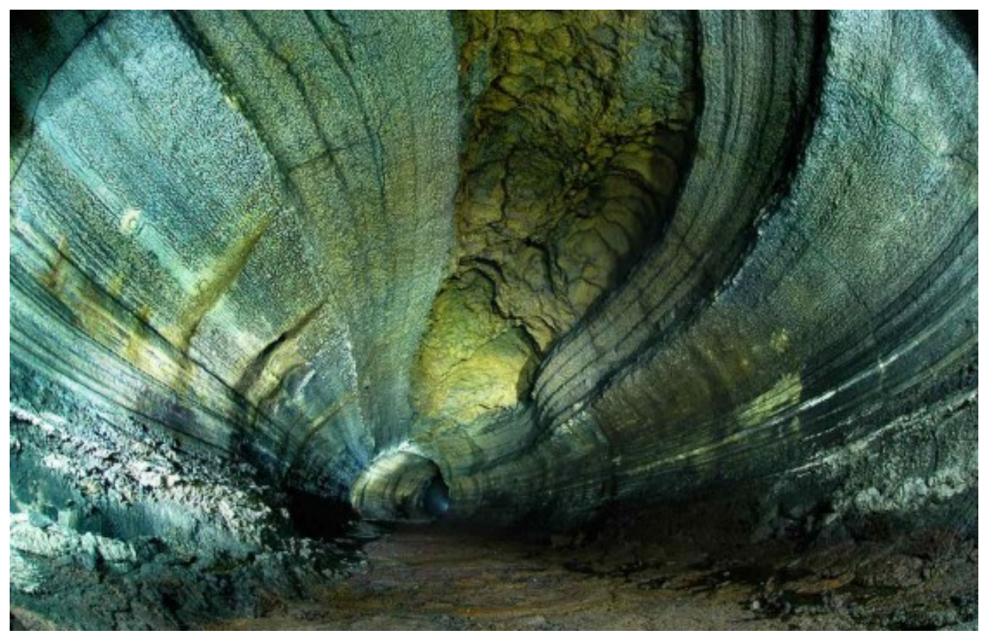
Jeju Lava Tubes

The second installment of our World Heritage Series sees us take a trip to Jeju Volcanic Island and Lava Tubes, South Korea's only natural site to make the revered list of UNESCO World Heritage List. While Korea has 11 identifiable places of special cultural importance, if you want to visit a place of physical significance then you have to take a trip to South Korea's largest island, 130 kilometers south of the peninsula. Jeju Island has a mythical feeling for many Koreans, while its appeal to Chinese tourists is growing exponentially; the Seoul to Jeju Island air route is the busiest in the world with a staggering 11.1 million passengers making the trip in 2015. While the amount of tourists, theme parks, and attractions may threaten to take away a bit of Jeju's charm, there is no doubting the natural beauty that the island possesses.