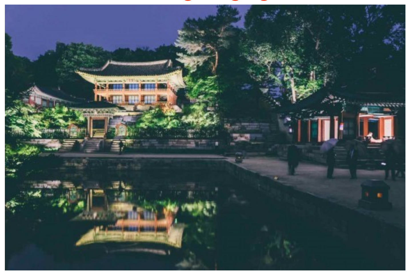
Changdeokgung Place

April 27, 2017 - In the fourth installment of our World Heritage Series, Asia Society Korea did not have to travel far as we made the short trip to Changdeokgung in downtown Seoul. For the many tourists seeking out royal palaces in Korea, the first point of call is usually Gyeongbokgung, the largest of the Five Grand Palaces built during the Joseon dynasty. However, it was its lesser known neighbor, Changdeokgung, that was awarded World Heritage Status in 1997 for having had great influence on the development of Korean architecture, garden design, and landscape planning over many centuries. The palace grounds are spectacular, comprising of royal buildings and a rear garden which boasts a 300-year-old tree, a pavilion, and a small pond. Construction of the palace began in 1405 and was completed in 1412.