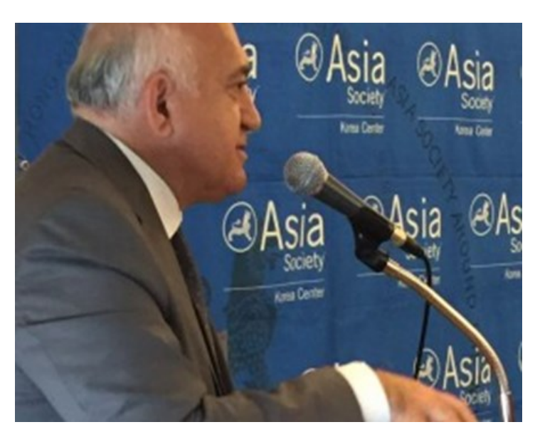
H.E. Arslan Hakan Okcal