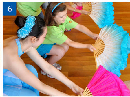
1. Be the Change 2. The Dances of India 3. Unveiling the East 4. Manga Style 5. Oceanic Adventure 6. The Dances of China