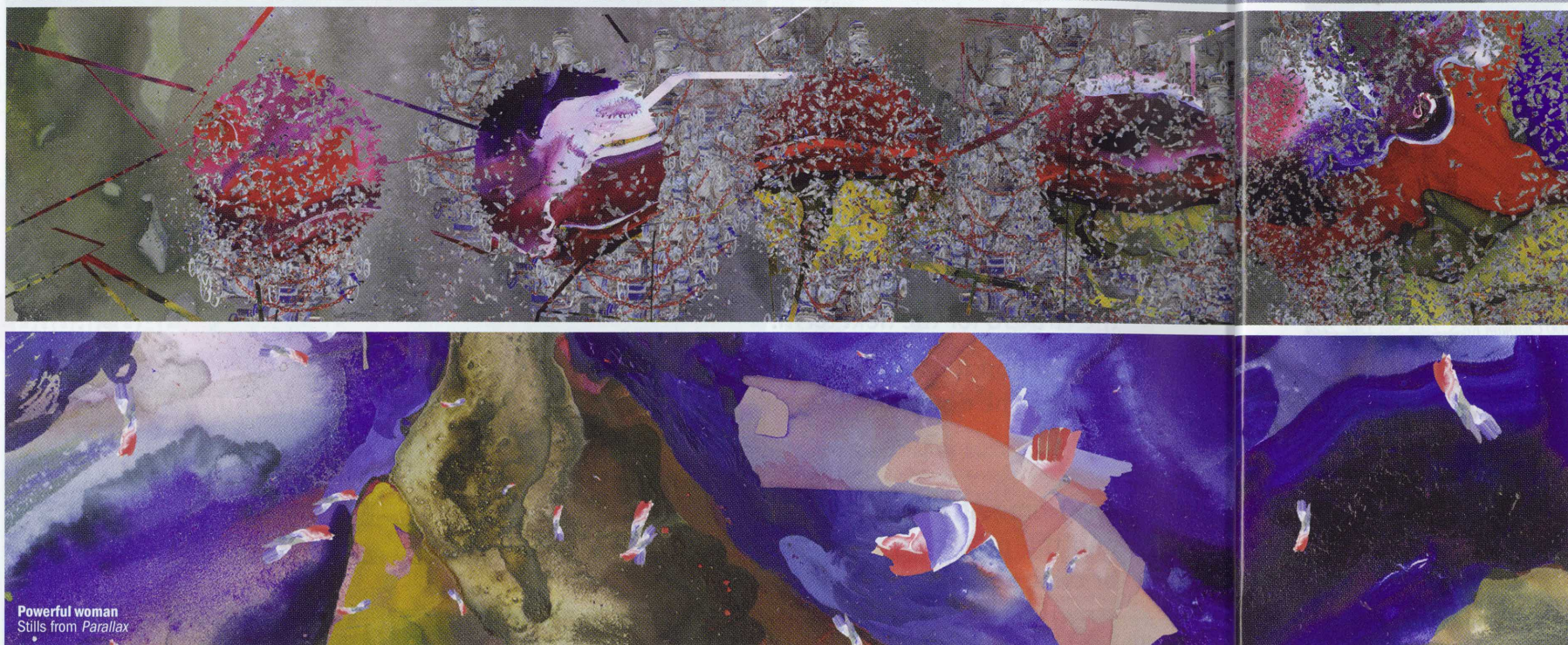
Powerful woman Stills from Parallax