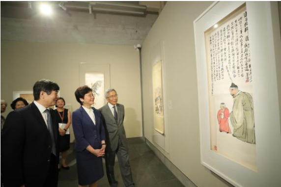
The Hon. Mrs. Carrie Lam Cheng Yuet-ngor, GBM, GBS, Chief Executive of the HKSAR, visiting a preview of The Hong Kong Jockey Club presents – Painting Her Way: The Ink Art of Fang Zhaoling at Asia Society Hong Kong Center.