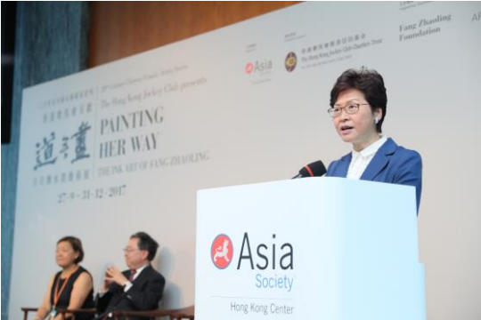
The Hon. Mrs. Carrie Lam Cheng Yuet-ngor, GBM, GBS, Chief Executive of the HKSAR, spoke tonight at the opening ceremony of art exhibition The Hong Kong Jockey Club presents – Painting Her Way: The Ink Art of Fang Zhaoling , held at Asia Society Hong Kong Center.