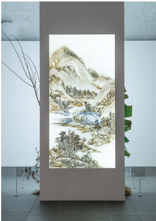
Background Story , 2014. Natural debris, glass panel and lightbox, H395 x W150 x D60 cm.