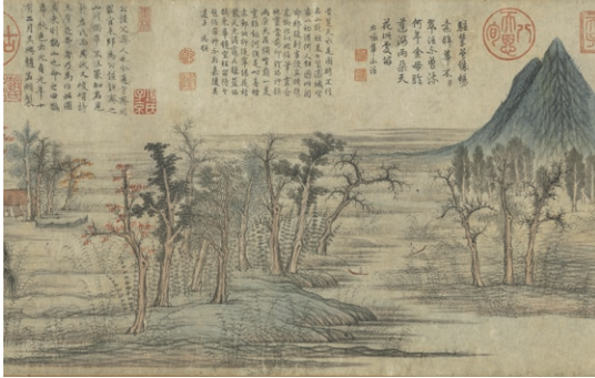
Autumn Colors on the Qiao and Hua Mountains , Zhao Mengfu (1254-1322), Yuan Dynasty (1279-1368). Handscroll, ink and color on paper, 28.4 x 90.2 cm. Collection of National Palace Museum.

The animation is based on a famous painting known as Autumn Colors on the Qiao and Hua Mountains by 13th century artist Zhao Mengfu. In The Character of Characters , Xu Bing brings this painting into an animated land where traditional objects and modern icons meet.