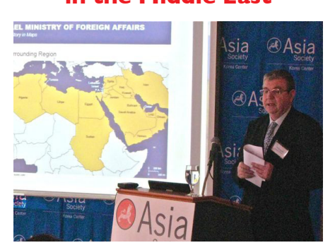
Ambassador Tuvia Israeli

"Maybe it is not the best time to discuss chances for [peace in] the Middle East," said H.E. Tuvia Israeli, Ambassador of Israel to the Republic of Korea, "But actually, it is never the right moment and on the other side of the coin, it is always the right time."