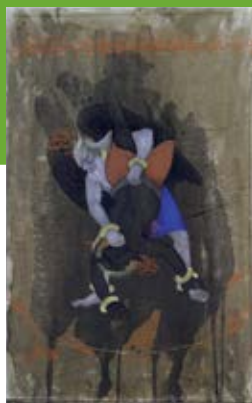
Untitled 1, Rustam Series, 2011–12; Untitled 2, Rustam Series, 2010; Untitled 3, Rustam Series, 2011–12. Watercolor, gouache, and ink on paper, 54 x 35 cm, 35 x 29 cm, and 35 x 29 cm, respectively. Solomon R. Guggenheim Museum, New York, Guggenheim UBS MAP Purchase Fund 2012.143–.145.