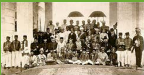
First Durbar (Conference of Rulers) held at Kuala Kangsar, Malaya, in 1897

► Do these photographs remind you of any you have seen? What is familiar about them? Where have you seen similar images?