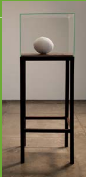
Left: 1:14.9, 2011–12. Polyester thread, wood, glass, and brass, 158 x 56 x 51 cm. 1/2 AP, edition of 3. Solomon R. Guggenheim Museum, New York, Guggenheim UBS MAP Purchase Fund 2012.148. © Shilpa Gupta. Photo: Courtesy the artist Right detail: © Shilpa Gupta. Photo: Courtesy the artist