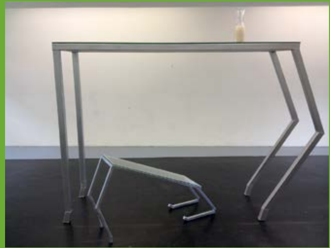
Our Children , 2012. Galvanized steel, glass, and milk, three parts: 157.5 × 227.3 × 59.7 cm, 66.7 × 113 × 30.5 cm, and 21.6 × 7.9 × 7.9 cm. Solomon R. Guggenheim Museum, New York, Guggenheim UBS MAP Purchase Fund, 2012, 2012.147. © Tang Da Wu. Installation view: No Country: Contemporary Art for South and Southeast Asia , Solomon R. Guggenheim Museum, New York, February 22–May 22, 2013.

Tang works in many mediums including painting, drawing, sculpture, installation, and performance. In Our Children , he refers to a story from Chinese opera in Teochew, the region in South China from which his family hails. The story focuses on the virtue of respect for one's parents ("filial piety") and the importance of cultural values, and the artist's sculpture represents an abstracted baby goat kneeling beneath its mother. The act of suckling is represented by a pitcher of milk