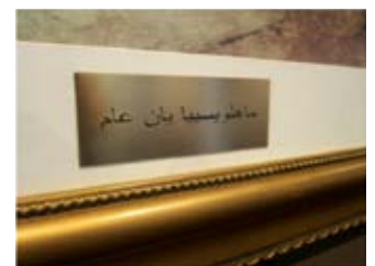
Keeping Up with the Abdullahs 2 and Keeping Up with the Abdullahs 1 , 2012. Chromogenic print with plaque in artist's frame, 65 x 86 cm, edition 2/8. Solomon R. Guggenheim Museum, New York, Guggenheim UBS MAP Purchase Fund 2012.152. and 2012.151 © Vincent Leong.