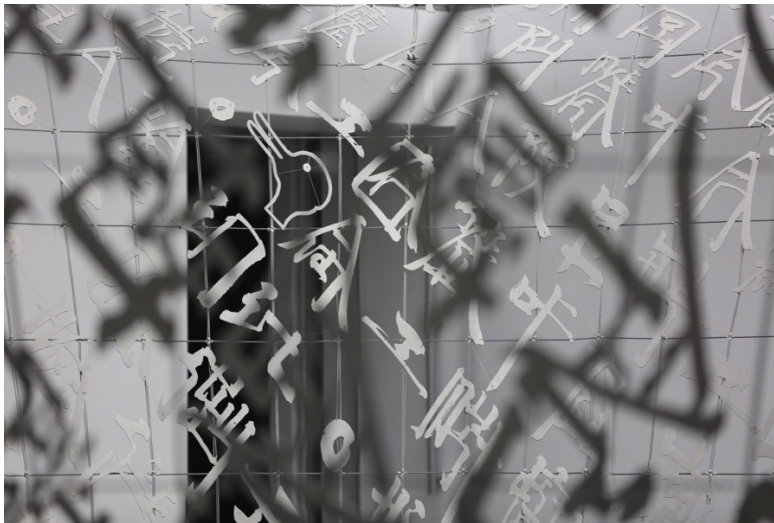
Xu Bing, detail of Gravitational Arena , 2023.

FEATURING ONE OF THE MOST SIGNIFICANT ARTISTS WORKING TODAY