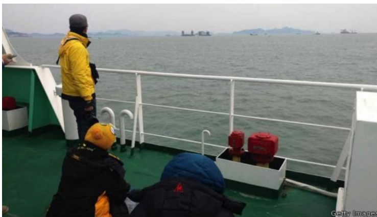
Family members looking on as the Sewol recovery process begin