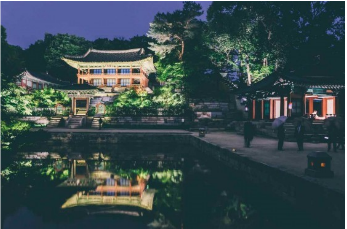
Changdeokgung Place

April 27, 2017 - In the fourth installment of our World Heritage Series, Asia Society Korea did not have to travel far as we made the short trip to Changdeokgung in downtown Seoul. For the many tourists seeking out royal palaces in Korea, the first point of call is usually Gyeongbokgung, the largest of the Five Grand Palaces built during the Joseon dynasty. However, it was its lesser known neighbor, Changdeokgung, that was awarded World Heritage Status in 1997 for having had great influence on the development of Korean architecture, garden design, and landscape planning over many centuries. The palace grounds are spectacular, comprising of royal buildings and a rear garden which boasts a 300-year-old tree, a pavilion, and a small pond. Construction of the palace began in 1405 and was completed in 1412.