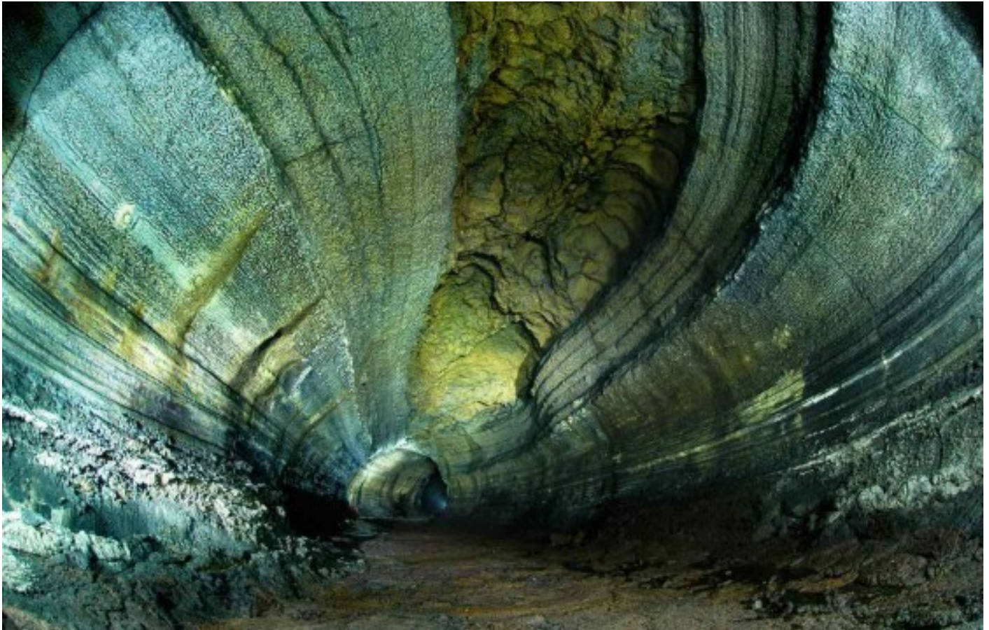
Jeju Lava Tubes

The second installment of our World Heritage Series sees us take a trip to Jeju Volcanic Island and Lava Tubes, South Korea's only natural site to make the revered list of UNESCO World Heritage List. While Korea has 11 identifiable places of special cultural importance, if you want to visit a place of physical significance then you have to take a trip to South Korea's largest island, 130 kilometers south of the peninsula. Jeju Island has a mythical feeling for many Koreans, while its appeal to Chinese tourists is growing exponentially; the Seoul to Jeju Island air route is the busiest in the world with a staggering 11.1 million passengers making the trip in 2015. While the amount of tourists, theme parks, and attractions may threaten to take away a bit of Jeju's charm, there is no doubting the natural beauty that the island possesses.