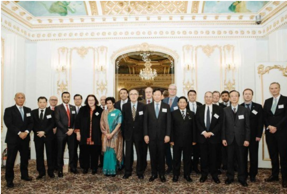
March 15, 2017 - The diplomatic community plays a huge role in supporting Asia Society Korea and with many new ambassadors arriving in Seoul over the past 18 months, the Korea Center held a special dinner to welcome them. (Continued on Page 21)