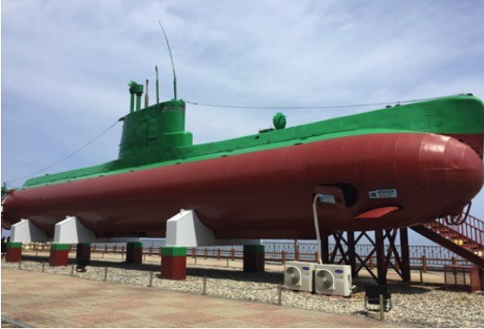
The captured North Korean submarine, The centerpiece of Gangneung Unification Park

(Continued) South Koreans had come from near and far to attend this match, donning Korean peninsula sweatshirts and chanting unification-themed songs in the hope that their support would in some way benefit inter-Korean relations.