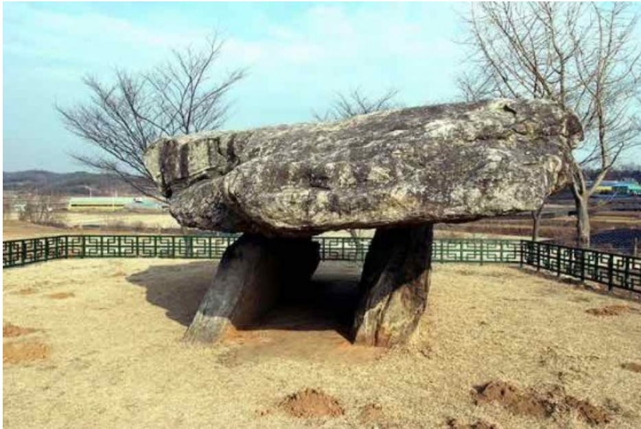
Dolmen at Ganghwa

January 2017 - For many seasoned travellers, UNESCO World Heritage Sites provide the ultimate bucket list items for experiencing the Earth's cultural and natural heritage. While it would take many years of travel to see all 1052 designated sights around the world, a short trip to Korea would enable you to tick off at least twelve. South Korea is home to eleven cultural sites and one natural site. Over the course of the next few months, Asia Society Korea will be previewing selected World Heritage Sites through a historical, cultural, and travel perspective. We kick off our program in the south-western part of the peninsula by visiting Gochang, Hwasun, and Ganghwa Dolmen Sites .