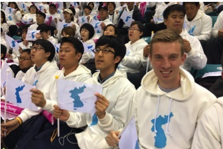
Fans were given flags and sweatshirts emblazoned with the Korean peninsula

The palpable tension of the stadium though, in an instant, was relieved and replaced with jubilation as the players high-fived. The crowd raised their unified Korean peninsula flags and continued to sing "We Are One", sensing that their encouragements was having an effect. Next, to mark the United Nation's International Day of Sport for Development and Peace, the president of the International Ice Hockey Federation took to the ice for a commemorative photo. As the players mixed and formed two rows for the picture, fans cheered wildly, with noise reaching an absolute crescendo. Listening to the fans, it was clear to me this match was not so much South Korea "versus" North Korea, but rather South Korea "with" North Korea.