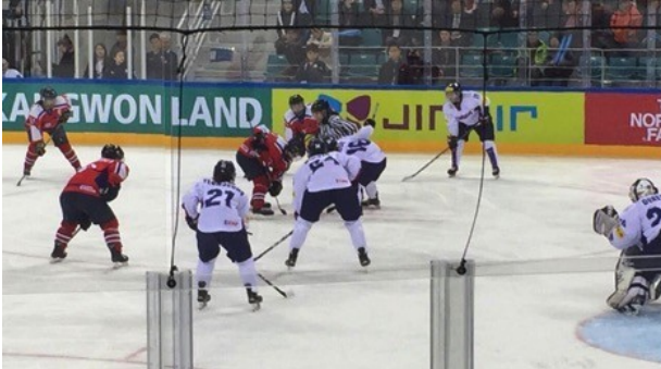
Noth and South Korea face off on the ice