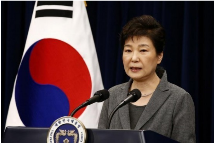
Park Geun-hye.