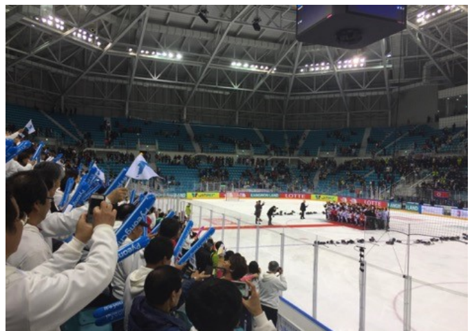
Fans erupt in applause as the players pose together for a commemorative photo