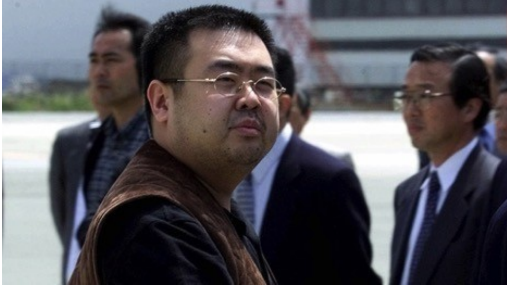
Kim Jong-nam in May 2001.