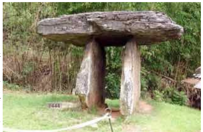
Dolmen at Gochang

Although the largest concentration of dolmens can be found in the south-western locations of Gochang and Hwasun, a third significant range of stones is situated on the island of Ganghwa, not far from Incheon Airport. For somebody wanting to visit South Korea's dolmens, planning is important as the sites are not geographically close to each other and are not well served by public transportation. On the plus side, the dolmens are located in rural areas of the country so you are generally left alone to explore these areas of significant cultural value. The Gochang, Hwasun, and Ganghwa Dolmen may well be the least populated UNESCO sites you visit.