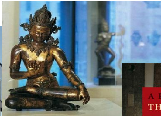
A PASSION FOR ASIA THE ROCKEFELLER LEGACY