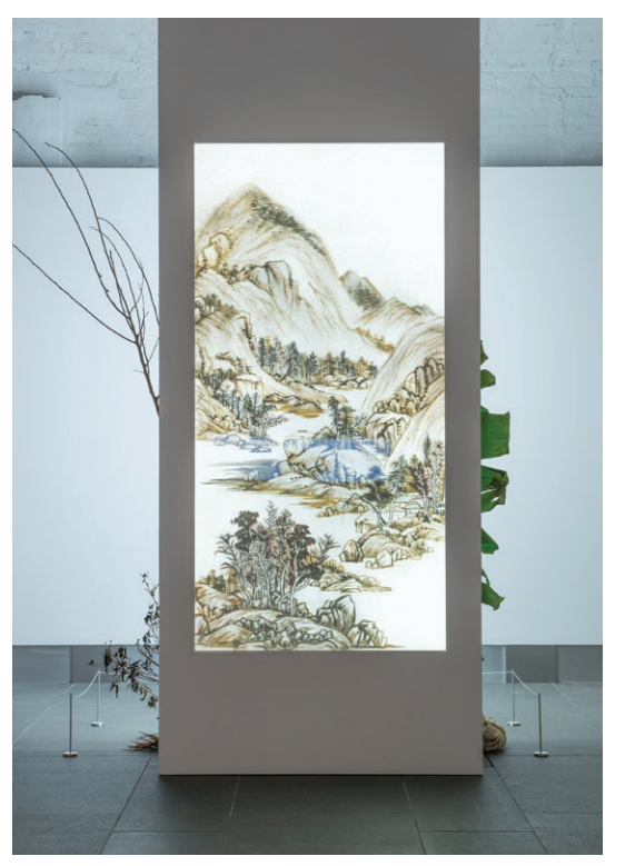
Background Story, 2014. Natural debris, glass panel and lightbox, H395 x W150 x D60 cm.

DESCRIBE what you are looking at. What kind of scenery is it? What is in the picture? What materials did the artist use?