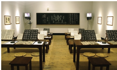
Square Word Calligraphy Classroom, 1994-1996, Classroom installation with instructional video, model books ( An Introduction to Square Word Calligraphy), copybooks, ink, brushes, brush stands, blackboard, framed student work. Installation view from Xu Bing in Berlin, Museum für Ostasiatische Kunst, Berlin (now Museum für Asiatische Kunst), Germany, 2004.