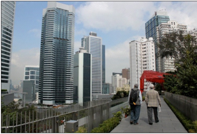
The Asia Society's Hong Kong Center overlooks the city's Admiralty and Central districts.

The Asia Society has just returned from Hong Kong, the host city of the inaugural Pacific Cities Sustainability Initiative (PCSI) Forum. Entitled "Tomorrow's City Today," the Forum was held at Asia Society's new Hong Kong Center and brought over 100 experts from around the Pacific Rim on February 18-20 for interactive expert discussions about the future of cities. The Forum was organized in partnership with the Urban Land Institute (ULI), a global nonprofit education and research institute whose mission is to provide leadership in the responsible use of land and in creating and sustaining thriving communities worldwide.