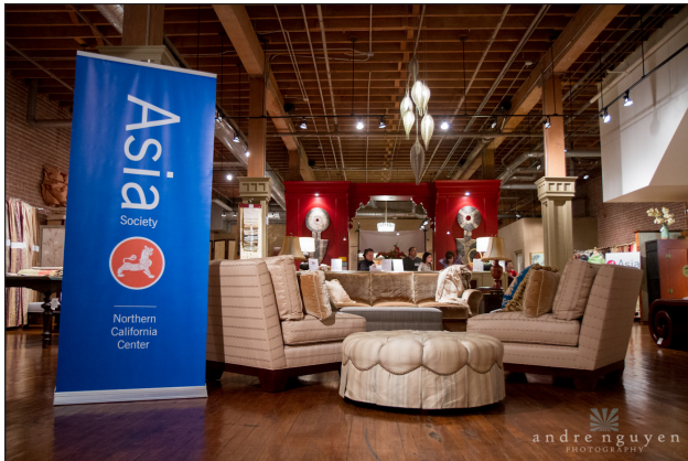
B. Mori & Co.'s San Francisco Design District showroom.