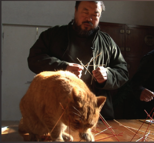
Alison Klayman, USA, 2012, 91 minutes Alison Klayman, 美國, 2012, 91 分鐘 In Chinese with English subtitles 國語對白, 英文字幕