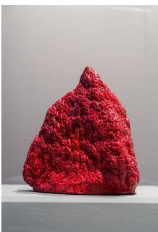
Yayoi Kusama (b. 1929 Matsumoto-shi, Japan) Untitled, 1974 painted bronze

Japanese artist Yayoi Kusama is internationally recognized for her large and diverse body of work, which includes painting, soft sculpture, collage, environmental installations, and performance art. Although she employs a wide variety of artistic media and techniques, a common thread that runs throughout her oeuvre is an interest in repetition, pattern, and psychedelic colors and forms. Beginning in the early 1950s, Kusama began covering surfaces of canvases, household objects, her own sculptures, and entire rooms with polka dots and what she called “infinity nets.” Vast fields of dots and nets became a trademark of her work, and directly reference the artist’s hallucinatory visions. Kusama described her Infinity Nets as paintings “without beginning, end, or center.” Nets Obsession TTS is part of this body of work. In this abstract painting, a web of small, repetitive looped marks is thickly painted in silver and covers the dark gray canvas. The mesmerizing, rhythmic painting is like an organic, metallic net that has been cast across our field of vision.