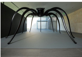
Mel Chin (b. 1951 Houston) Cabinet of Craving, 2011 ebony-polished white oak, glass, antique porcelain, and silver

Rirkrit Tiravanija's experiences as an itinerant are a source of inspiration for his work. The artist was born in Argentina, is of Thai origin, and was raised in Thailand, Ethiopia, and Canada. Tiravanija's was educated in Chicago and New York, and now lives and works in New York and Berlin while continuing to spend time in Thailand. Instead of falling under conventional categories of art, Tiravanija's artistic practice emphasizes the social role that art can play and promotes cultural interaction, particularly through the activity of cooking and eating. Many of Tiravanija's installations involve him cooking dishes such as Pad Thai in the gallery space. Untitled (young man, if my wife makes it...) , is based on the plastic food that the artist saw showcased in restaurant window displays in Japan. For this sculpture, Tiravanija made a realistic plastic cast of the Pad Thai that he cooked for visitors to one of his gallery exhibitions in Japan. The big bowl of noodles with chopsticks hovering in mid-air may stir happy memories of sharing meals and conversation.