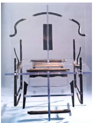
Shao Fan (b. 1964 Beijing, China) project no. 1 of 2004 chair, 2004 elm wood and acrylic From the collection of Leticia Loya

Siah Armajani is an Iranian-born sculptor and architect widely celebrated for installations and public artworks that combine functional architecture and references to American poetry and history. In Dictionary for Building , a series of works that Armajani began in 1979, he deconstructs building elements such as doors, windows, stairs, and tables. Dictionary for Building: Door in Window #2 , a work from this series, consists of two black, hinged doors that open to support one another as a single, freestanding sculpture. On the right is a screened door, while the one on the left is a solid door with a long oval window. The window's oval shape has been enlarged and repeated behind the door as a kind of frame – a door in a window. Armajani calls attention to the beauty of the basic architectural elements we encounter in everyday life, while at the same time leaving us to contemplate the nature of these portals.