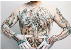
Huang Yan (b. 1966 Jilin, China) Chinese Shang Shui Tattoo No. 6-2 Series, 1999 c-print

Chinese artist Huang Yan is celebrated for his artistic practice that merges painting, photography, and performance art. Yan believes that the most authentic representation of the philosophy of the ancient Chinese literati is the classical landscape. In his signature work, Yan transposes this traditional art form onto the human body – often his own. In Chinese Shang Shui Tattoo No. 6-2 Series , for example, the body serves as the artist's canvas. This life-size photograph portrays a figure's torso and arms that are bent at the elbows. A scene depicting mountains is painted onto his chest, and trees crawl up his forearms. Yan calls attention to the material of the paint and of the body – details such as a meditating figure and a cabin are visible, as are tiny wrinkles in the skin upon which the scene is painted. Employing the genres of portraiture and traditional Chinese landscape painting, while also referencing tattoo practices and performance art, whose primary medium is the body, Yan brings traditional Chinese culture in contact with the contemporary global world.