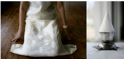
Priya Kambli (b. 1975 Mumbai, India) Me (Flour) , 2009 inkjet print, edition 1/10 The Museum of Fine Arts, Houston Purchase with funds provided by Photo Forum 2010

Yasumasa Morimura is a Japanese artist whose photographs and performances appropriate famous images derived from popular culture and art history to create both humorous and unsettling self-portraits. Through the extensive use of costumes, make-up, props, and digital manipulation, Morimura transforms himself into the subjects of art historical masterpieces, political figures, and celebrities. Self-Portrait (Actress) / After Marlene Dietrich 1 is part of Morimura's series that is based on Hollywood film stars. The photograph represents Morimura dressed up like Marlene Dietrich in her role as the cabaret singer Lola Lola from the 1930 film The Blue Angel , which brought Dietrich to fame. Copying the publicity photo from the film, Morimura portrays himself in a glamorous and playful pose seated on top of a wooden barrel and wearing a wig, dress, stockings, and heels. In his self-portrait photographs, Morimura both pays homage to these iconic figures and challenges the idea of celebrity.