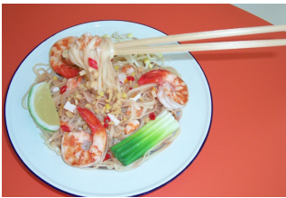
Rirkrit Tiravanija (b. 1961 Thai, born Argentina) untitled (young man, if my wife makes it...), 1999 plastic, wood, and enamel plate, edition 27

Vietnamese American artist Dinh Q. Le is best known for his trademark woven photographs. When he was a child, Le's aunt taught him the traditional Vietnamese weaving technique that he now employs in his artwork. To make Untitled (SPAM) Le wove together strips of photographs as one would weave a basket or a Vietnamese grass mat. Taken from both eastern and western sources, Le uses pictures of commercial products, of himself and his family, and of the Vietnam War. As we view his woven photograph, the interlaced images transform before our eyes: dark gray circles visible on the top left side of Untitled (SPAM) appear one minute like the centers of white daisies and like bullet holes the next. Other visual elements that shift in and out of view include the words "SPAM," "Hickory Smoke," and "Kleenex," as well as images of fists, soldiers wielding spears, and pallbearers carrying a coffin. The longer one looks at Le's woven photograph, the more images come into view.