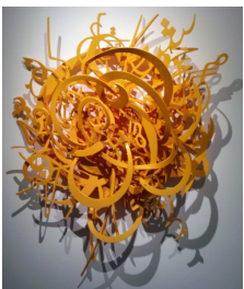
Simeen Ishaque Farhat (b. 1964 Karachi, Pakistan) Ablaze, 2011 acrylic on cast urethane resin

Quiet, Quiet is a sculpture made of fiberglass, resin, and wood, which is then finished with pristine coats of lacquer. In this sculpture, a tower of two disembodied heads that appear to be part monkey, part human child, sit in a three-foot-wide teacup that is tinted light sea-foam green. The sculpture is whimsical and fantastical, perhaps recalling scenes from the tea party in Alice in Wonderland , but it is also troubling – the heads are precariously stacked and bear expressions of sadness or vulnerability. At first glance, Quiet, Quiet may make us smile, but it leaves us pondering what lies beneath the surface of the work.