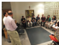
Leader & Pastor sharing meeting