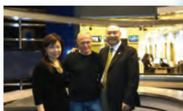
Visit Knesset TV