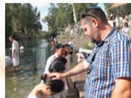
Bless by Levi descendants