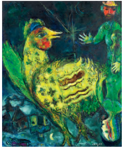
Marc Chagall, Le Coq, 1968