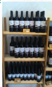
Visit Golan height Winery

Recommend use EL AL Airlines direct to Israel, fast and comfortable!