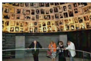
VIP Tour to Vad Vashem

Jerusalem 、 Bethlehem 、 Nazareth 、 Swim and Float in Dead Sea 、 Shopping at AHAVA Dead Sea Product Outlet