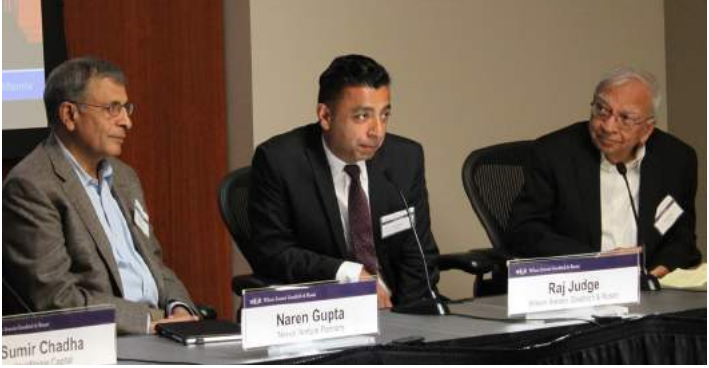
Forecast Asia explored reforms in India (Asia Society)