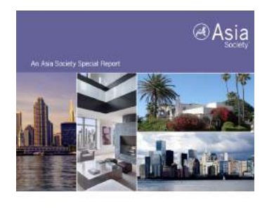
Breaking Ground: Chinese Investment in U.S. Real Estate

ASNC's Signature Initiatives aim to mobilize effective global responses to some of the most important issues facing the U.S. and Asia relationship. Through roundtable forums, conferences, special reports, and public events, these initiatives aim to inspire new thinking among leaders and practitioners in government, the private sector, and academia on the critical policy and business questions of the day.