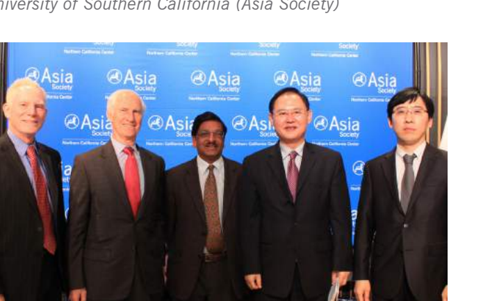
A look at the Trans-Pacific Partnership with experts from Korea and the U.S.