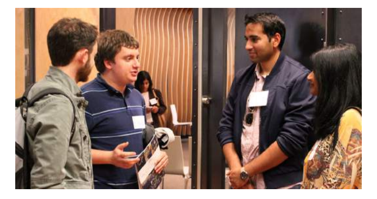
Guests and speakers network at an event on "Civic Hacking"