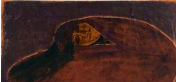
Untitled (Portrait of a woman with veil), 1934. Colored ink and opaque white on silk 35 5/8 x 23 13/16 in. (90.5 x 60.5 cm) Rabindra Bhavana, 00-1849-16

To explore the exhibition, visit http://sites.asiasociety.org/tagore/ .