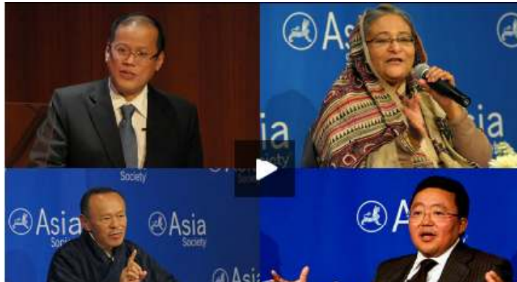
Philippines' President Benigno Aquino III, Bangladesh's Prime Minister H.E. Sheikh Hasina, Bhutan's President H.E. Lyonchhen Jigme Y. Thinley, and Mongolia's President H.E. Tsakhia Elbegdorj

The four Asian heads of state, though coming from disparate countries and backgrounds, spoke about freedom, justice, accountability and respect for human rights as essentially linked to democracy. For video highlights, visit, http://asiasociety.org/blog/asia/video-new-york-asian-leaders-link-economic-and-social-development-democracy .