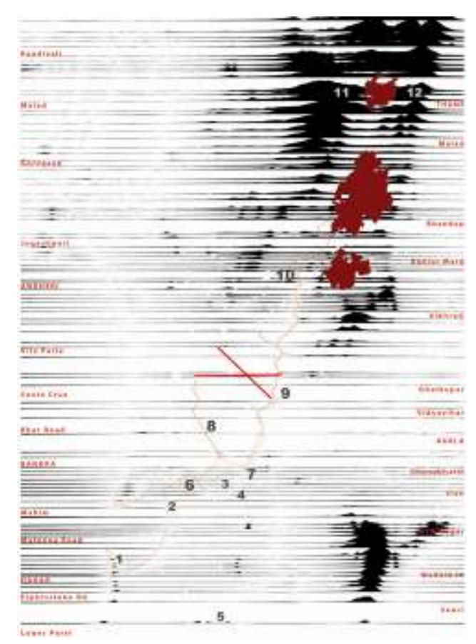
(Detail of a sectional view of Mumbai)

SOAK, on the other hand, situates Mumbai in a fluid threshold between land and sea, a shifting saline and fresh water gradient of creeks, and a monsoon surface of holdings. The ground between land and sea is understood to be a filter in section drawings, photo-works and models that present this alternative representation of Mumbai's terrain. And twelve fresh proposals provoke us to rethink the larger terrain of the Mithi that reaches down from the Sanjay Gandhi National Park to historic forts along what used to be the Mahim creek.