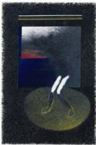
Zahoor ul Akhlaq. A Visit to the Inner Sanctum 4, 1996. Acrylic on canvas. H. 83 x W. 56in. (210.8 x 142.2 cm). Collection of Nurjahan Akhlaq and Sheherezade Alam.

September 10, 2009 through January 3, 2010