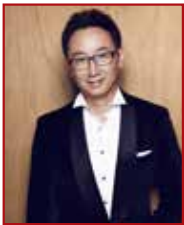
LU Chuan Writer, Director and Producer

朱浩伟以他极具视觉震撼力的不同类型、媒体和成本的各类作品被大家所熟知。不论是用舞蹈语言叙事的《舞出我人生》系列，用音乐语言记录的《贾斯汀·比伯：永不言败》，用动作语言渲染的《特种部队二：全面反击》，还是用魔术语言展现的《惊天魔盗团二》，朱浩伟的作品总是活力四射，他的招牌风格定义了当下的流行娱乐文化。除了他的好莱坞电影，朱浩伟也是一个公认的网络创新者。他的超级英雄系列舞蹈剧《特别舞者军团》为他赢得了2011年国际数字艾美奖的先锋奖项，而他导演的贾斯汀·比伯的音乐电视《美女与节奏》拥有超过6.2亿的点击。他获得了CLIO奖的“安全之舞”短片在每个维珍美国航班上播放，也在网络上轰动一时。朱浩伟毕业于南加州大学影视艺术学院。