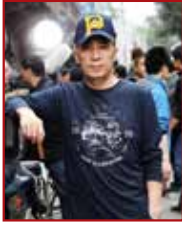
CAO Baoping Writer, Director and Producer

Cao Baoping is known for his subtle exploration of human emotions and compelling crime dramas that are both dark and humorous. He debuted as a director with Trouble Makers , which was screened at the 2006 Berlin International Film Festival and Montreal International Film Festival and won the New Talent Jury Award and Asian Audience Choice Award at the Shanghai International Film Festival. He won a Best New Director Award at the 2008 San Sebastian International Film Festival for The Equation of Love and Death .