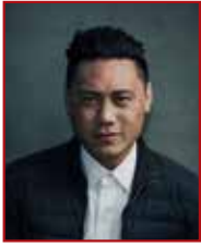
Jon M. Chu Writer, Director and Producer

Jon M. Chu is known for his visually stunning work in projects across genre, medium and budget. Whether telling a story through the language of dance in the Step Up films, music in the Justin Bieber documentary, action in the G.I. Joe: Retaliation film or magic in his latest feature film, Now You See Me 2 , Chu's signature style bursts with energy that defines pop culture entertainment. In addition to his Hollywood studio films, Chu is recognized as an online innovator.